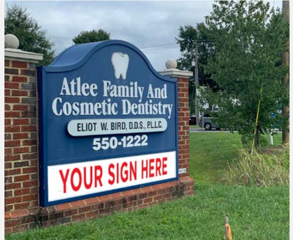
SUITE 102 — 2,278 SF